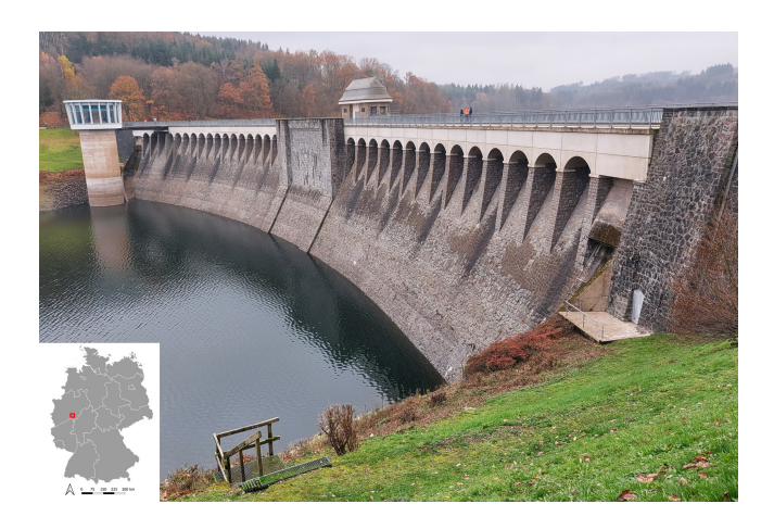
Fig. 1 . The Lister gravity dam, as seen from the impounded Bigge reservoir on the downstream side.

area of 68.2 km², creating a reservoir with a capacity of 21.6 million m³ [7]. It is operated by the Ruhrverband, a non-profit-oriented water management company based on German public law. The dam is equipped with several measurement techniques, including trigonometric measurement points, water level, and temperature monitoring. However, no plump system has been installed on the Lister gravity dam, reducing the deformation monitoring to a few samples yearly. Figure 1 shows the Lister Dam from the downstream side.