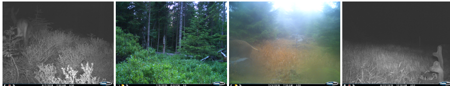
Fig. 1: Appearing animals in camera trap images from the Bavarian Forest National Park. Already for humans, the separation of images with and without animals can be a difficult task in several situations.

of five images in a short time interval when detecting motion. Thus, the same animal(s) can be seen during a sequence and therefore the sequence needed only one annotation. Unfortunately, this label cannot be mapped to all five frames, since an animal often does not appear in the last frames anymore, leading to wrong annotations. Instead, the label is assigned to the first frame only, which reduces the dataset to about 20% of all images. Thereby, it is not guaranteed that this assignment is always correct, which explains the label noise within the data. This is why the following results need to be interpreted with caution.