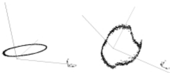
Figure 4. Reconstructed motion path of the tracked object in 3-D based on the 3-D estimation using triangulation. Left: ellipse as seen from the camera. Right: view of the trajectory from above (this should be a circle).

in the synchronization between the image acquisition and the transfer of the camera data (tilt and vergence angles). Similar experiences have been noted by [9] and explicitly modeled for the control of a monocular active camera system.