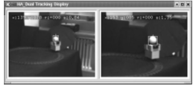
Figure 3. Screen dump during live experiment. Left and right camera image with focal length being 19.5 mm and 31.4 mm respectively. Tracked object is indicated by white rectangle.

First we tested the sensibility in 3-D position estimation using the triangulation technique described in Section 3.2 for a static setting. A static setting means that the object was fixed in 3-D. In both camera images the object was tracked over time while simultaneously varying the camera parameters. Based on the 2-D image coordinates of the extracted target region the 3-D position is computed. The quality in 3-D localization was estimated for varying resolutions of the object in the image (i.e. varying focal lengths) and different sizes of the reference template (i.e. different zoom settings for the initial image, in which the reference template has been selected). The quality in 3-D localization is measured by the standard deviation in the 3-D position estimate after triangulation. Table 1 and Table 2 summarize the results. In both cases, i.e. when zooming in and zooming out with respect to the reference template size, we got the smallest standard deviation for the largest focal length for both cameras. This means, that the algorithm performs best in either case for maximum resolution of the image. It is both interesting and plausible that the most stable results in the 3-D estimation by triangulation are achieved if the reference template has low resolution. It should be mentioned, that due to the pose of the world coordinate system, errors in depth estimation correspond mainly to errors in the y -coordinate.