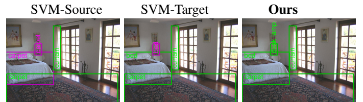
Figure 2. Results for object classification with given bounding boxes and scene prior knowledge: columns show the results of (1) SVM-Source, (2) SVM-Target, and (3) transform-based domain adaptation using our method. Correct classifications are highlighted with green borders. The figure is best viewed in color.