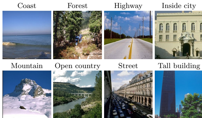
Fig. 2. Example images of each class of the dataset of [11] which we use for evaluation.