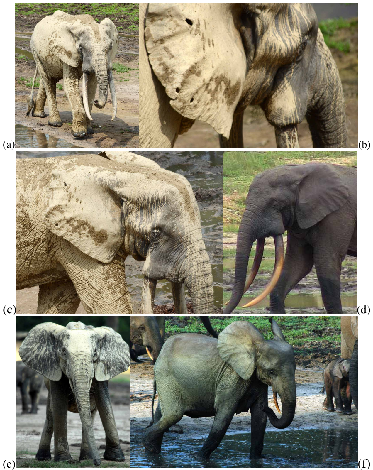
Figure 3: Possible difficulties in the dataset: (a) contours of the elephant vanish through color change caused by mud; (b) image is zoomed in too much; (c) similar to the images before: contours of the ear hardly visible and parts occluded by zoom; (d) the same elephant as is the three previous images, but with much darker skin; (e) rare front view of the elephant; (f) multiple elephants in the same image.