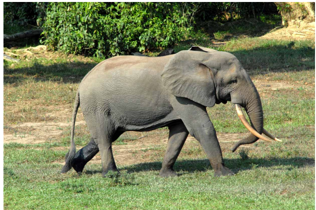
Figure 1: An example image from the dataset showing the elephant Ishmael.

For animals, other anthropogenic factors come along, like poaching and the clearing of rainforests. This can lead to emigration of animals, or, in the worst case, extinction of whole species [7], which, in turn, can lead to a strong decline in biodiversity.