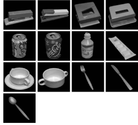
Fig.2: The DIROKOL image database [10]

For proving the benefit of our work, we performed experiments on the DIROKOL image database [10] which consists of 13 real objects (office and health care domain) which are presented in Fig.2. The image database consists of 1860 training images and 1860 test images per object with a resolution of 256x256. The pose parameters of the training acquisition a turntable