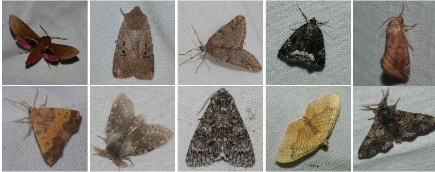
Fig. 1: Example images from the EU-Moths dataset from different classes.