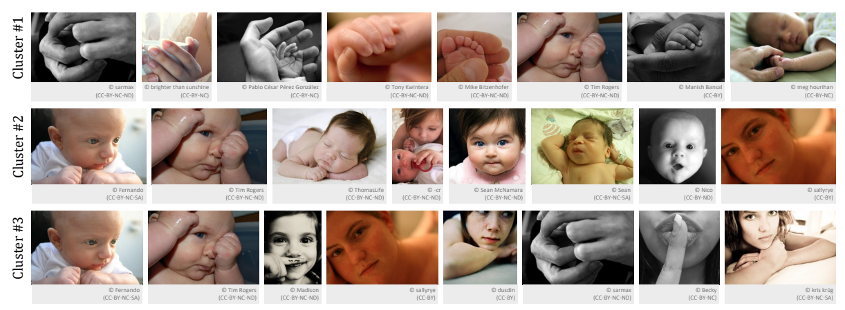
Figure 4: Top refined results for the query from Figure 1.