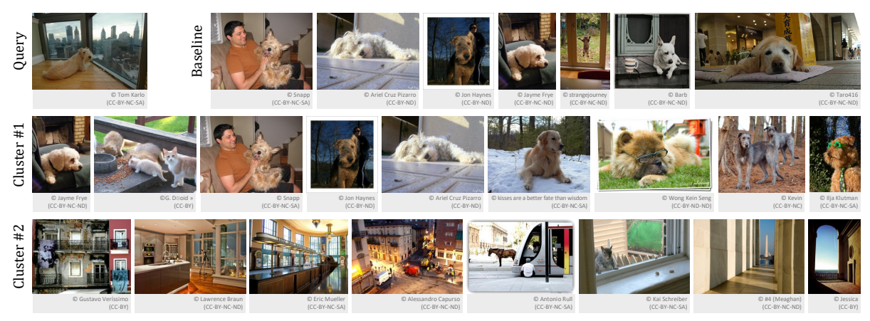
Figure 5: Baseline and refined results for another query with two different meanings.

a baby are the prominent content of some images.