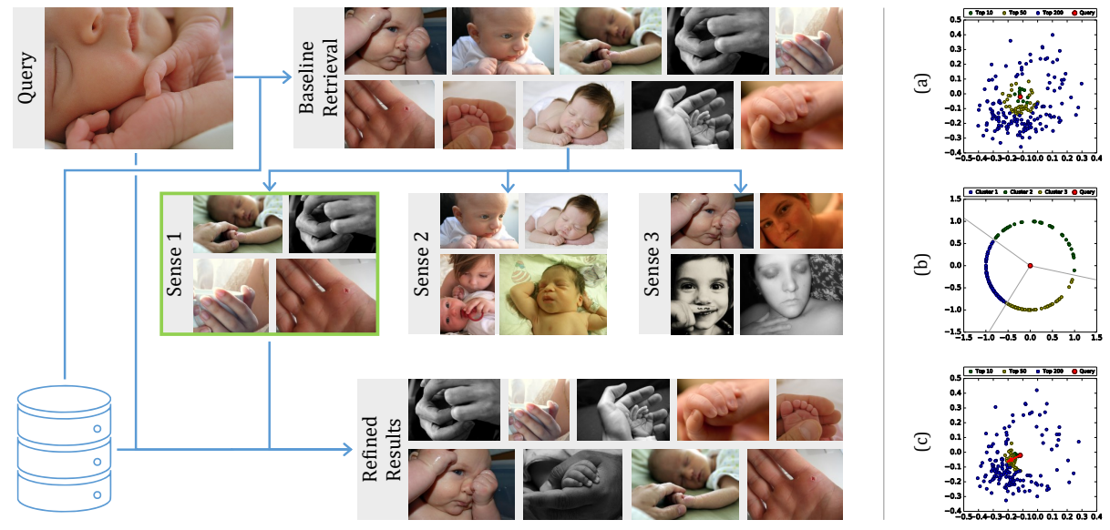
Figure 2: Left: Illustration of query image disambiguation and refinement of retrieval results. In this example, the user selected Sense 1 as relevant. Right: Schematic illustration of the data representation at each step in 2-d space.

The proper number k of clusters depends on the ambiguity of the query and also on the granularity of the search objective, because, for instance, more clusters are needed to distinguish between poodles and cocker spaniels than between dogs and other animals. Thus, there is no single adequate number of clusters for a certain query, but the same fixed value for k is also likely to be less appropriate for some queries than for others. We hence use a heuristic found in literature for determining a query-dependent number of clusters based on the largest Eigengap (Cai et al., 2004):