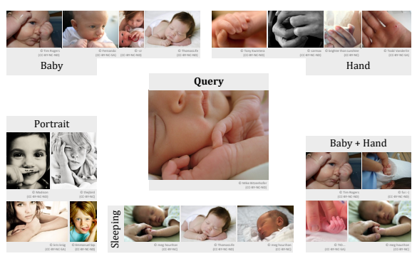
Figure 1: An example of query image ambiguity. Given the query image in the center, the user might be searching for any of the topics listed around it, which do all appear intermixed in the baseline retrieval results. All images are from the MIRFLICKR-25K dataset (Huiskes and Lew, 2008).

In some applications, specifying a textual query for images may even be impossible. An example is biodiversity research, where the class of the object on the query image is unknown and to be determined using similar images retrieved from an annotated database (Freytag et al., 2015). Another example is flood risk assessment based on social media images (Poser and Dransch, 2010), where the user searches for images that allow for estimation of the severity of a flood and the expected damage. This search objective is too complex for being expressed in the form of keywords ( e.g. , "images showing street