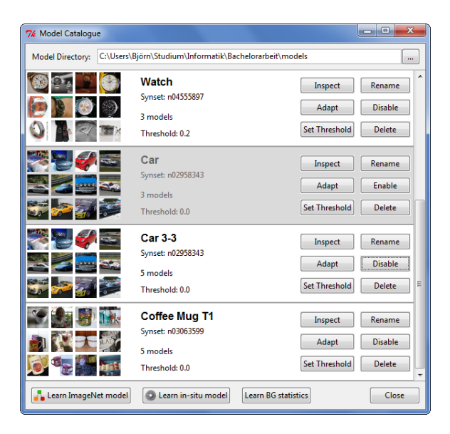
Figure 1: Model Catalogue window of the GUI.

Sample Acquisition We use the ImageNet dataset (Deng et al., 2009) for automatic acquisition of a large set of samples for a specific object category. With more than 20,000 categories, ImageNet is one of the largest non-properiatery image databases available. It provides an average of 300-500 images with bounding box annotations (annotated by crowd-sourcing) for more than 3,000 of those categories and, thus, is suitable for learning object detection models. Everything a user has to do in order to learn a new model using the ARTOS GUI is to search for a synset and to click "Learn!" (see Figure 2). For now, ARTOS requires access to a local copy of the ImageNet images and annotations (or a subset at least), which must be available on the file system, but we are planning to change this in future with a download interface.